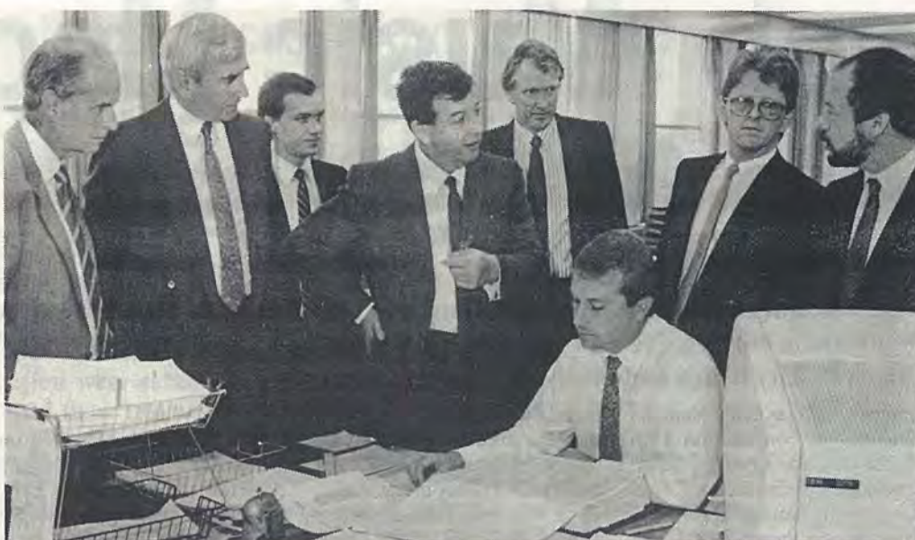
Energy Secretary Mr. Wakeham (centre) meets staff in Manweb's Income Section